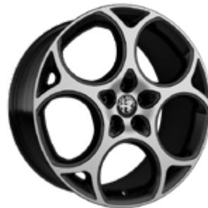
1MJ 19" Alloy wheel dark finish, diamond cut