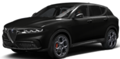
Alfa Black 601