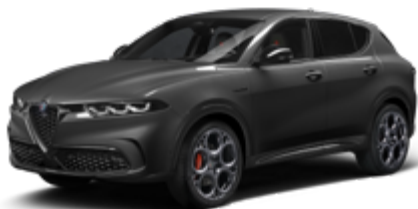
Vesuvio Grey 581