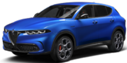
Misano Blue 756/A