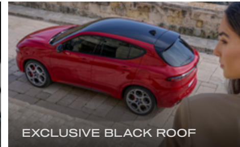
EXCLUSIVE BLACK ROOF