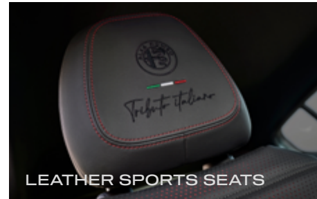
LEATHER SPORTS SEATS