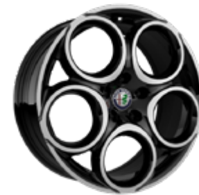
WFL 18" Alloy wheel dark finish, diamond cut