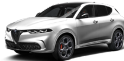
Banchise White with Black Roof 222/C