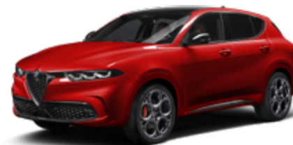
Alfa Red with Black Roof 956/C