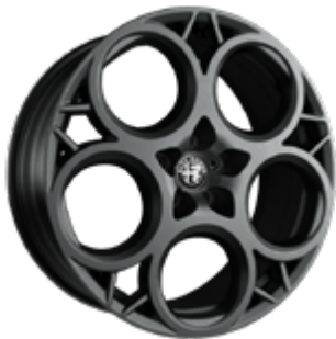
1M5 20" Alloy wheel grey finish