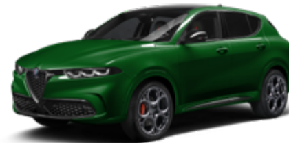
Montreal Green with Black Roof 041/B