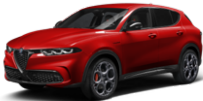
Alfa Red 414/C