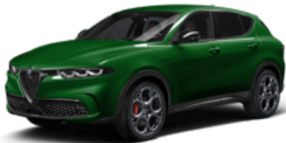
Montreal Green 398/D