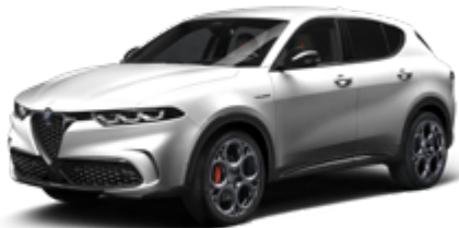
Banchise White 240/C