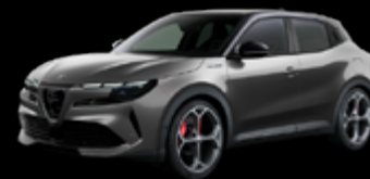
Arese Grey / Black Roof