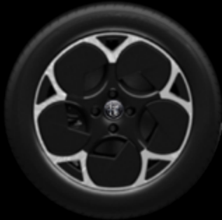
2VX - 18" Aero alloy wheels diamond cut