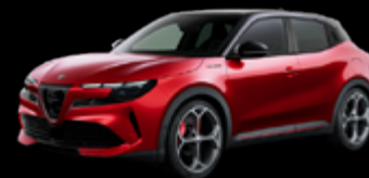
Brera Red / Black Roof