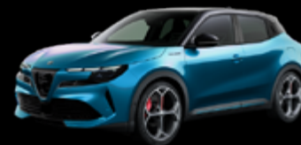
Navigli Blue / Black Roof