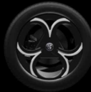
WP8 - 18" Fori alloy wheels