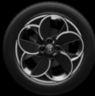
1M5 - 18" Petali alloy wheels diamond cut