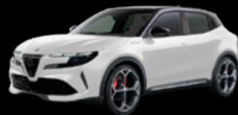
Sempione White / Black Roof