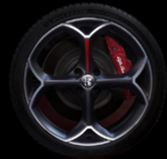
5RK - 20" Venti alloy wheels diamond cut