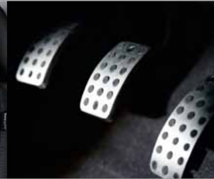
Aluminium sports pedals