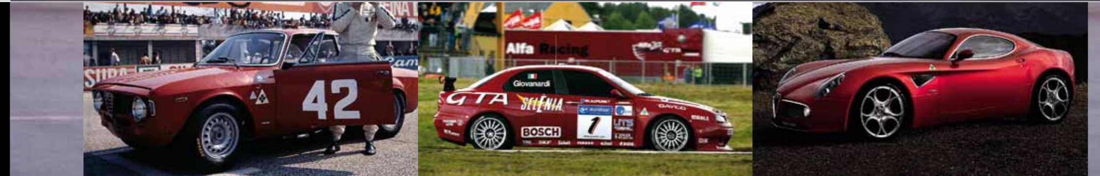
1965 Giulia Sprint GTA 2002 156 GTA, Giovanardi 2008 Alfa 8C Competizione