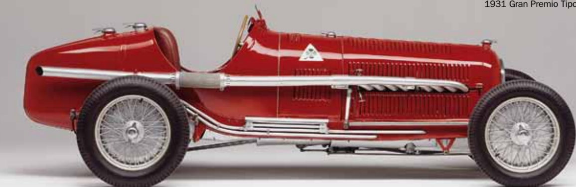
1931 Gran Premio Tipo B P3