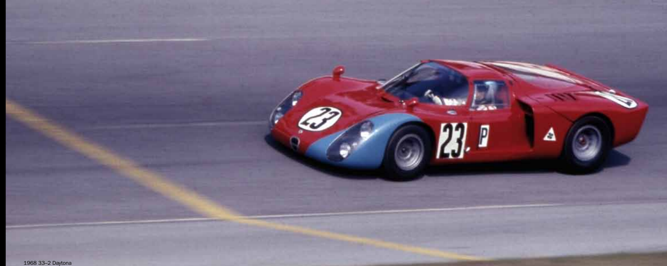
1968 33-2 Daytona