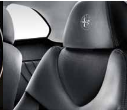
Sports seats upholstered in black sports leather