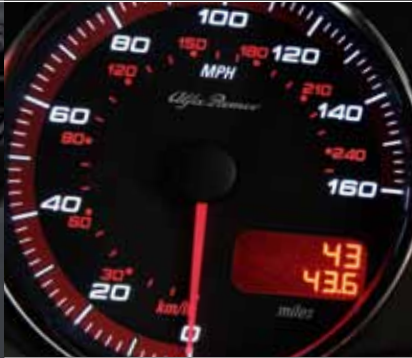
Sports dials with red background