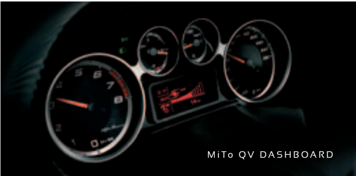
MITO QV DASHBOARD